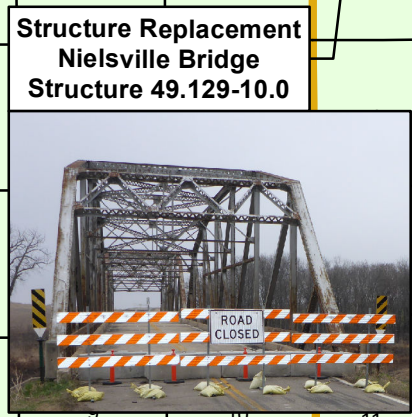
Structure Replacement Nielsville Bridge Structure 49.129-10.0